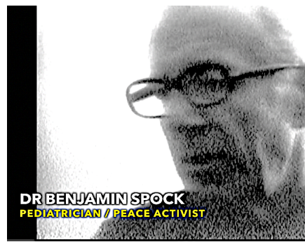
DR BENJAMIN SPOCK PEDIATRICIAN / PEACE ACTIVIST

Without contemporary police-line press prohibitions and without self-consciousness in front of the newly-invented home video camera, the early indy video filmmakers bring viewers directly to the action: behind-the-scenes planning meetings, civil disobedience face-offs, Commie-baiting counter demonstrators, mass and personal arrests, chants, ecstatic dances, guitar- and Frisbee-playing in jail, and a protester even kisses DC Police officers. With a video verité style - black & white, no narrator, wide-angle lens, long takes, lots of moving camera - and fast-paced with many informational titles that provide context to contemporary audiences - the integrity and freshness of the eyewitness footage captivate the viewer.