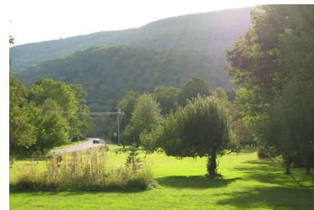
Sun sets at Maple Tree Farm

Videofreex archive - In Motion Productions NYC studio